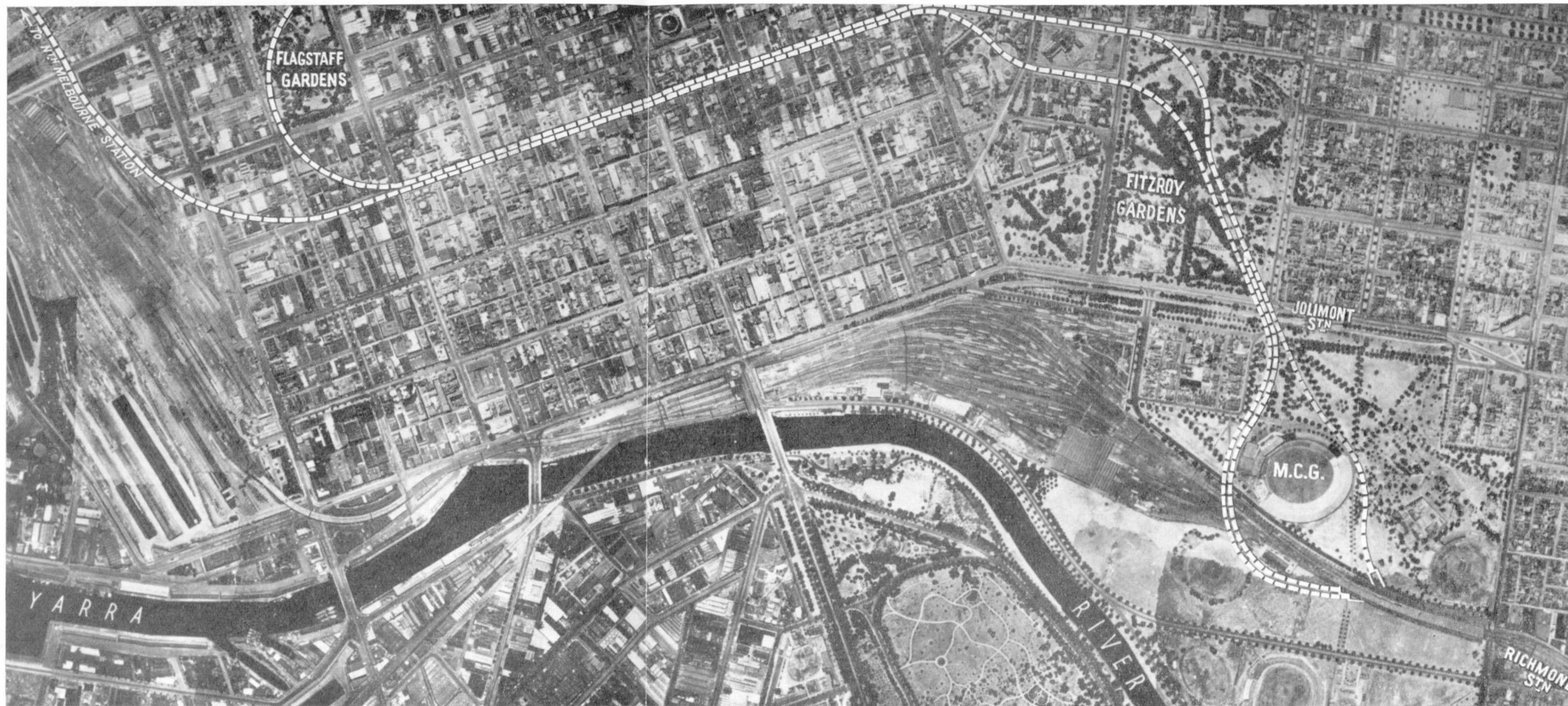
PLAN OF MELBOURNE'S PROPOSED UNDERGROUND RAILWAY

Fewer trains inevitably meant heavier loads and slower speeds, longer stops at stations and—worst reproach of all—late arrivals. Heavier trains limit the use of the more modern and more comfortable carriages the Railways possess, and still hinder the full restoration of buffet cars. Almost everything, one might think, has contrived to discourage rail travel.