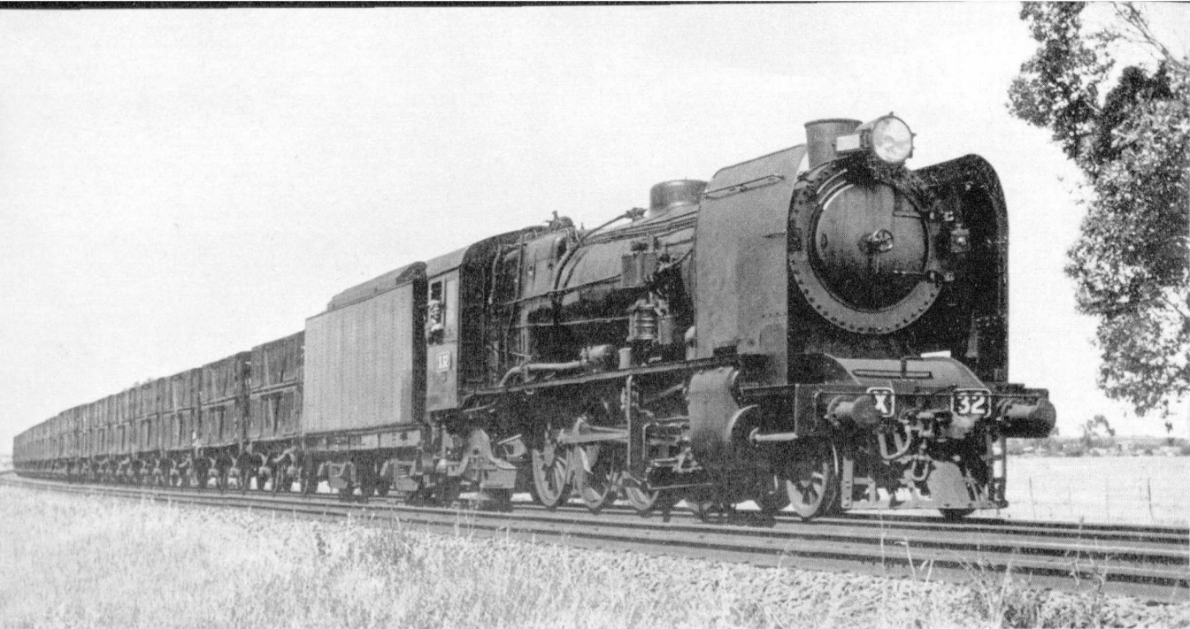
BROWN COAL FIRED ENGINE

Another important and immediate project is main line electrification. The first stage concerns the Gippsland line, between Dandenong and Traralgon. Electrified, regraded and with progressively duplicated track, it will cope with the rapid exploitation of Morwell brown coal, make substantial operational economies and help to reduce the State's demand for New South Wales coal by about sixty thousand tons a year. Electric locomotives to be imported for this line will be suitable for hauling heavier passenger and freight trains faster. New sub-station plant will be ordered, shortly, for this and some of the suburban lines.