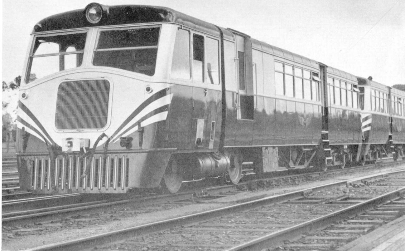
DIESEL RAIL-CAR AND TRAILER

Highly versatile machines, they will speed up express passenger and freight services, and return valuable savings.